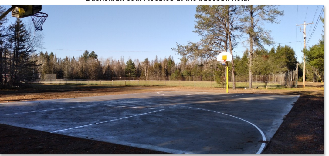
Basketball court located at the baseball field.