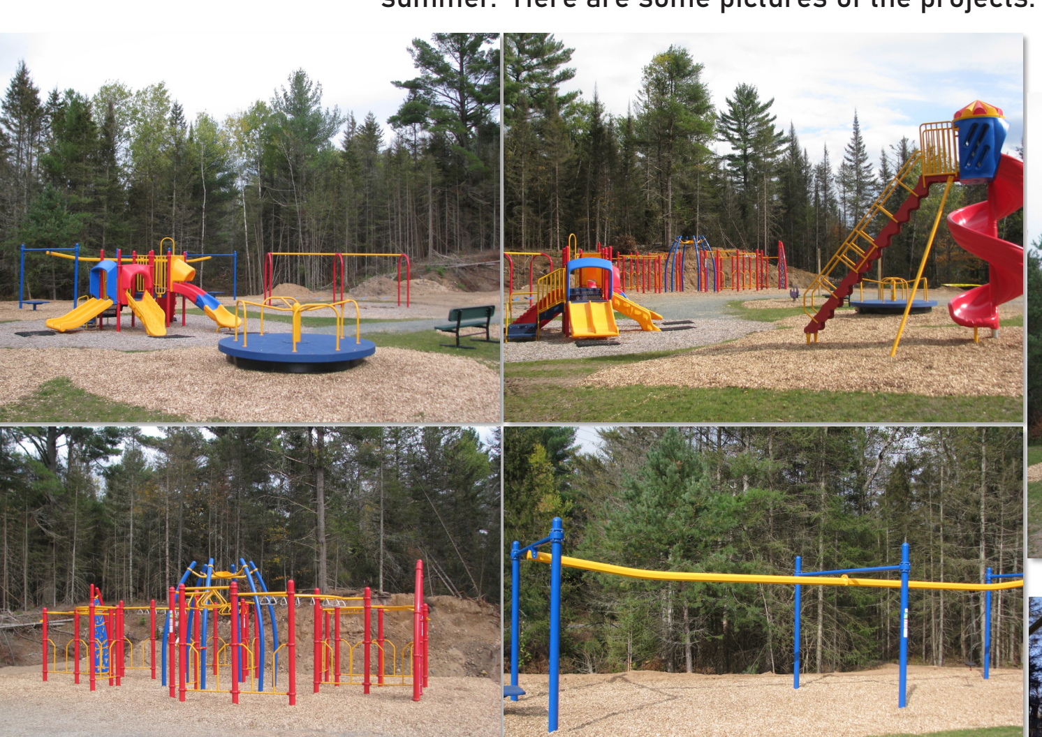
After the snow is gone, please take a ride with the kids and enjoy the new playground space! Host a get-together under the new pavilion, fish in the lake, and renew the joy inside you!

You may have noticed and enjoyed the incredible new improvements to the park that were completed this summer! The board is very proud and excited about the changes that have taken place over this crazy chaotic time. Along with the new playground equipment, there were also upgrades to the baseball field, which included re-doing the entire outfield, and landscaping outside the fence. The basketball court located at the ball field was also finished with a concrete court that will hold up for many years to come. There was also a roll-out dock that was put in at the Fish Lake Access Site so that kids can enjoy fishing throughout the summer. Here are some pictures of the projects.